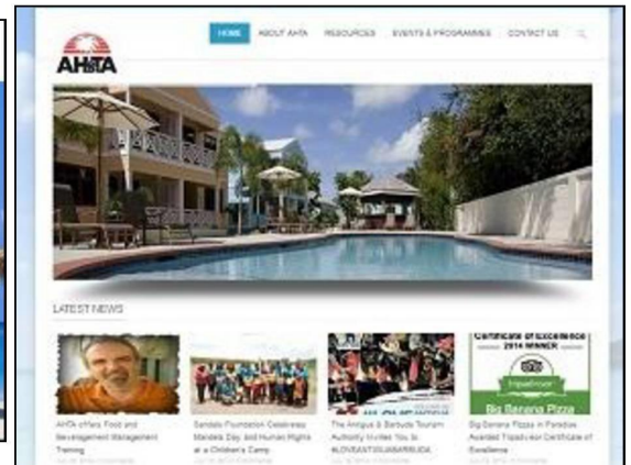
Corporate site for Antigua Hotels & Tourism Association ( www.antiguahotels.org )