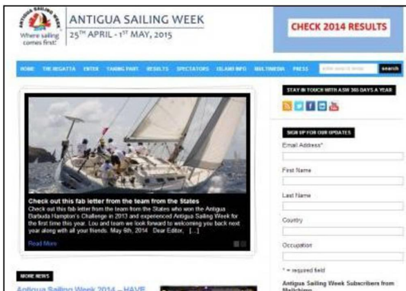
Multifunctional site for Antigua Sailing Week ( www.sailingweek.com )