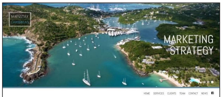
Website for Mainstay Caribbean ( mainstaycaribbean.com )