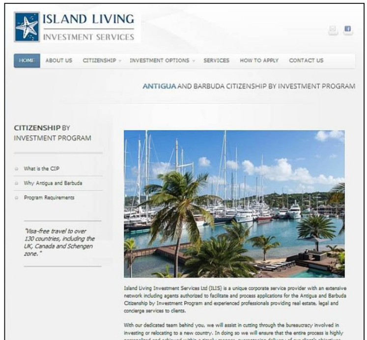
Corporate site for Island Living Investment Services ( www.ilis.ag )