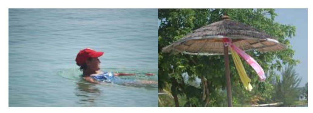
Just another glorious weekend at Jolly Harbour Yacht Club!