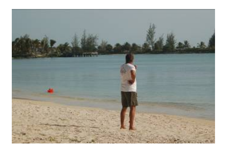
Well, it doesn't get much more perfect, does it? All calm on the starting front....