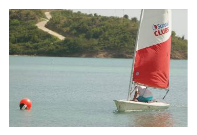
Some close racing followed....